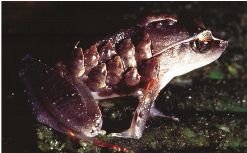
Figure 1 A male Liophryne schlaginhaufeni transporting froglets. Eleven froglets are visible (out of 22 in total) on the lateral and dorsal surfaces of the adult. The froglet located on top of the father's head is preparing to jump off.

remote rainforest at 800–1,350 m, where the topography and rainfall (6.4 m per year) 2 are extreme. All microhylid frogs on New Guinea are thought to develop directly from eggs, skipping the aquatic tadpole stage and hatching as miniature versions of the adults 3 .